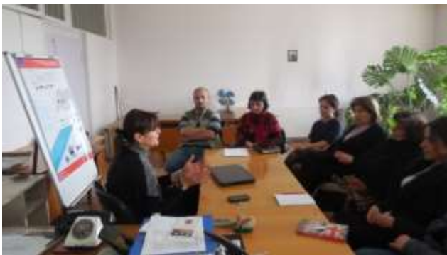
GTU. Internal kick-off meeting