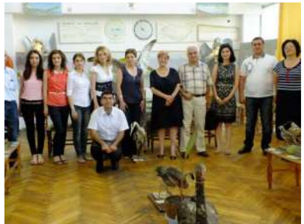
Yetri. Dissemination events