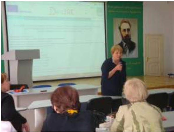
Dissemination in BGKU