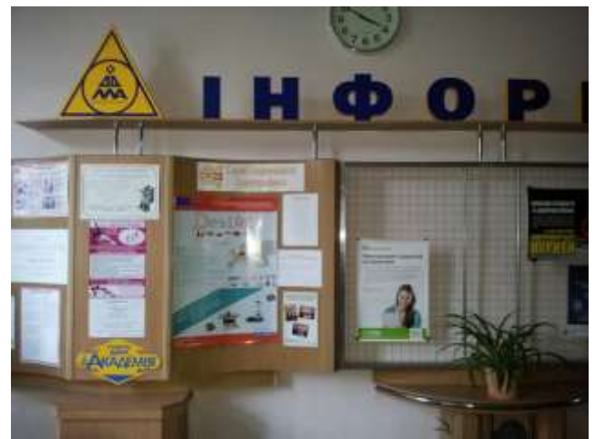
Dissemination in the DSEA

Meetings with target groups and stakeholders