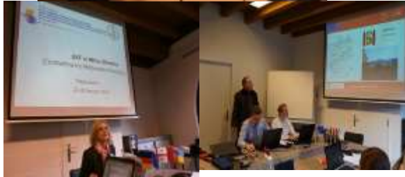
EU partners presentations