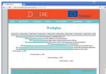
Web-site of the project