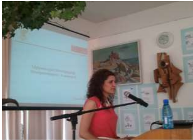
Dissemination in NUACA