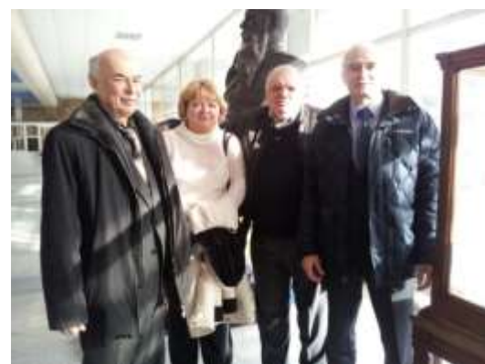
Dissemination in DSEA

Meetings with target groups and stakeholders