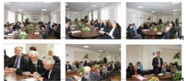
CEPU Dissemination events