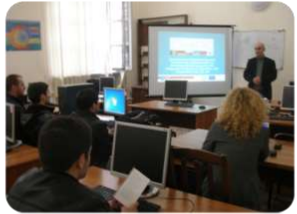
TSU. Internal kick-off meeting