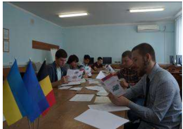
ZNTU. Dissemination among students

Partners in target universities provide local web-resources: